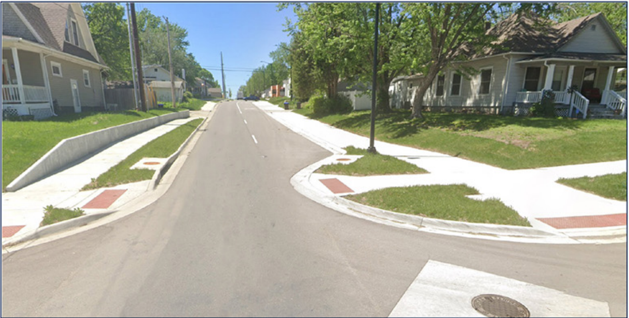
Examples of bulb-outs along the now-completed 12th Street Project.