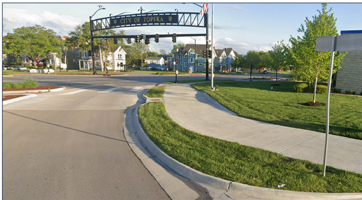
Examples of bike lanes and shared-use paths along the now-completed 12th Street Project.