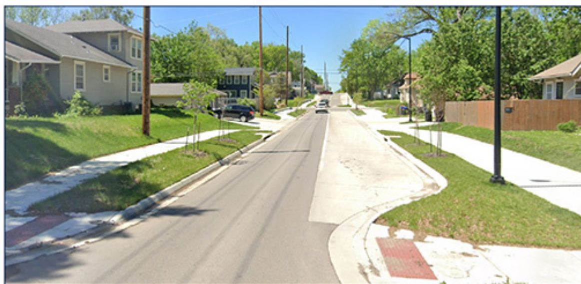
Delivery and Access Lanes along the now-completed 12th Street Project.