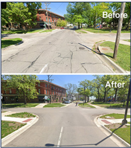
12th and Western