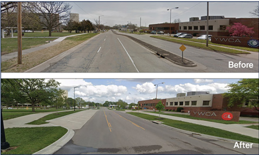
12th and Van Buren