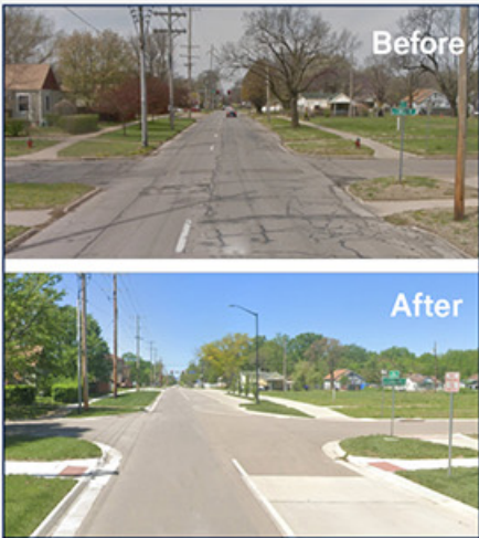
12th and Jewell

American Council of Engineering Companies of Kansas 50,000+ Population Category